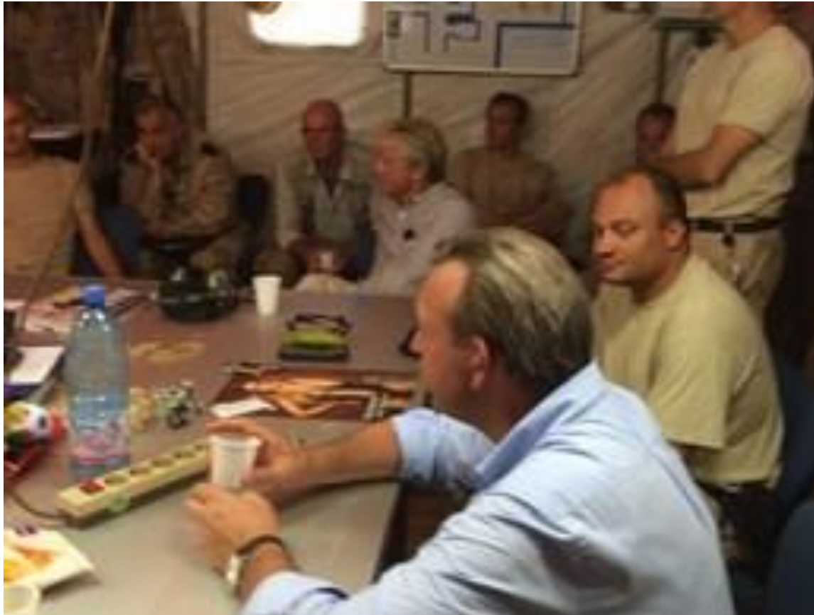
Mali 2016 – In conversation with Dutch troops. Camp Castor, Gao.