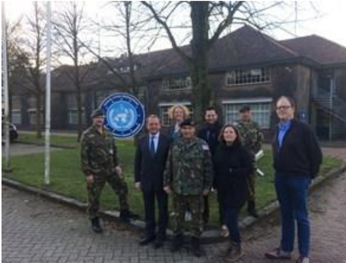
March 2017 – Visiting with the Office of the Veterans Ombudsman the Dutch School for Missions abroad